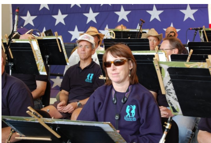
Fourth of July, 2011