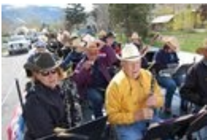
Old West Days Parade, 2011 (Or was that "Cold Wet" Days Parade?)

Fax: 307-377-7055 Email: Office@JHCBand.org